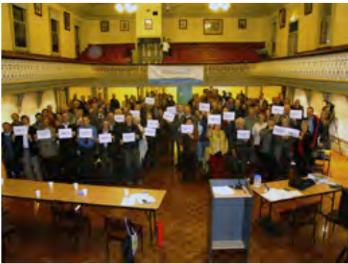
Loud and proud...