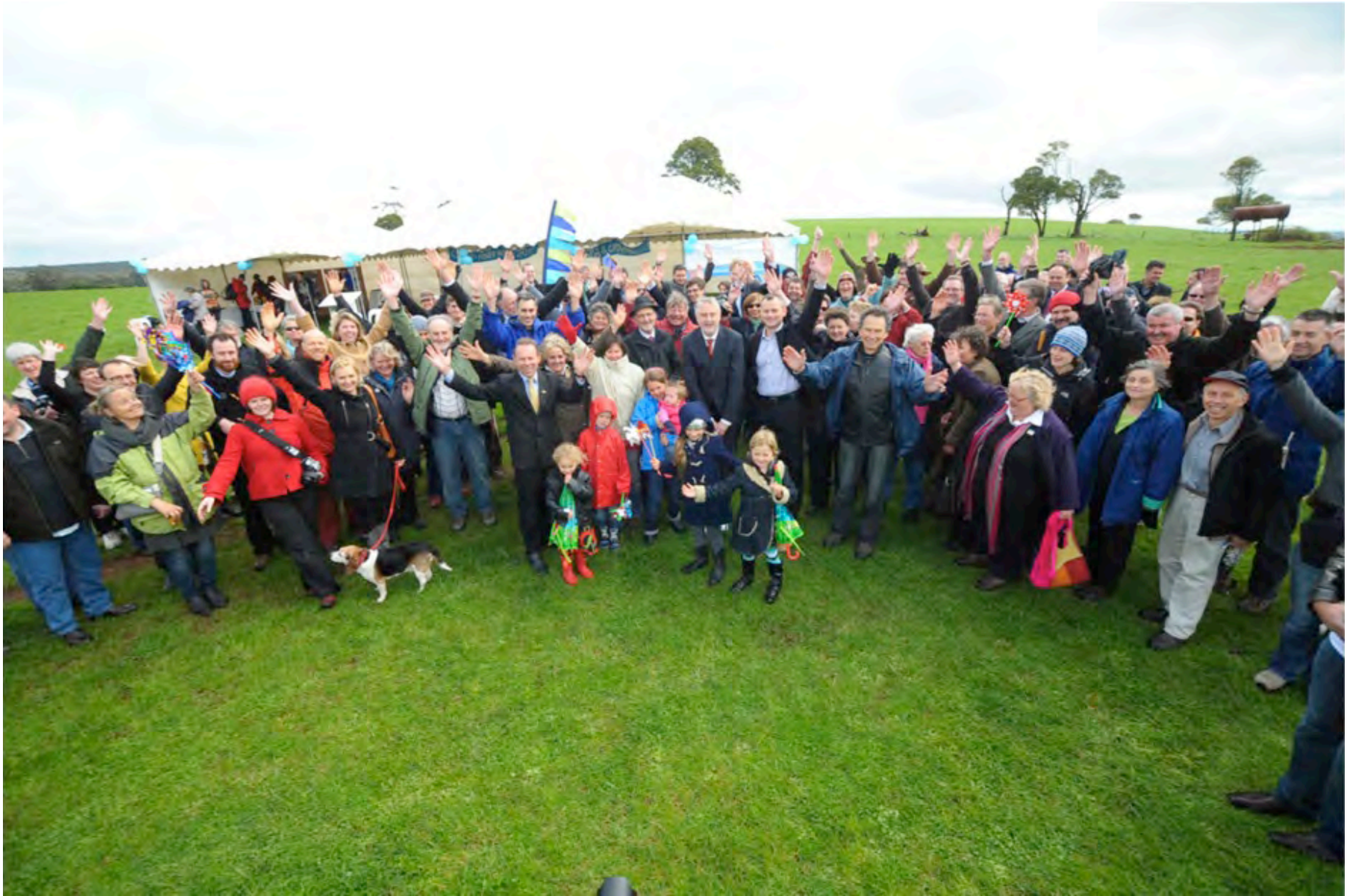
Ground-breaking ceremony — 8 October 2011