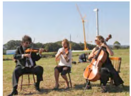
Community looks on as turbines are raised