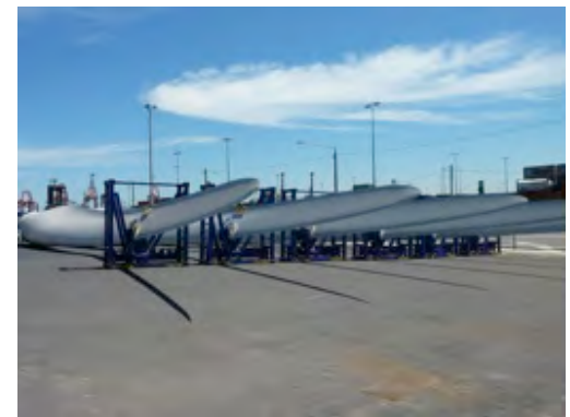
Unloading turbine components — Melbourne, February 2011